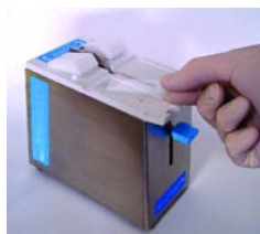
Step 1: Place slide

Specifications: 6' x 4' x 6' (L x W x H) 3.2 lbs. • 15cm x 10cm x 15cm (L x W x H) (1.45 Kg)