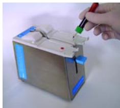
Step 2: Drop blood