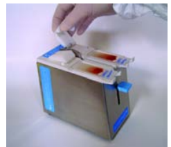
Step 5 : Clean glass