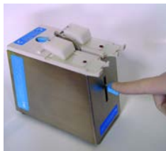
Step 3 : Press down