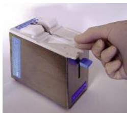
Step 1: Place slides