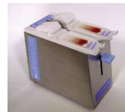
Step 4: Release