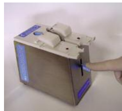
Step 3: Press down