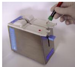
Step 2: Drop blood